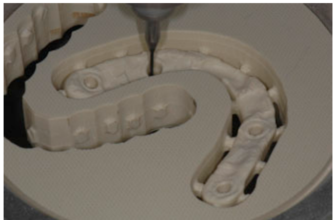
Fig. 3. Fiber-composit disk during milling process. After the digital design, the project is realized through a milling machine.