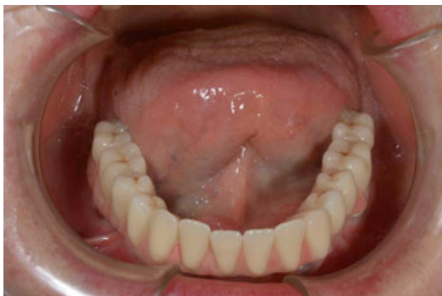
Fig. 4. Intra-oral view, framework is cemented to abutments.

subjected to variable efficacy [28], cause more stress to patients and have longer rehabilitation period.