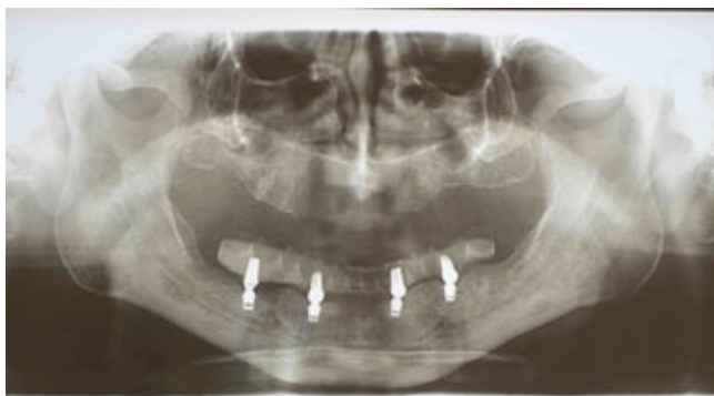
Fig. 5. Radiographical evaluation, note the subcrestal position of implants, the metal-free substructure with denture teeth in position. The opposite dentition in this patient was a complete removable denture.

Another difference concerns bio-tolerability. The reference material (metal alloy) is used despite a lack of robust clinical tolerance studies [36]. Corrosion represents a concrete risk, as cobalt and nickel are released into the oral cavity [37–40], and long-term effects have not yet been fully discovered [1,37,41,42]. The use of a metal-free prosthesis may solve the problems related