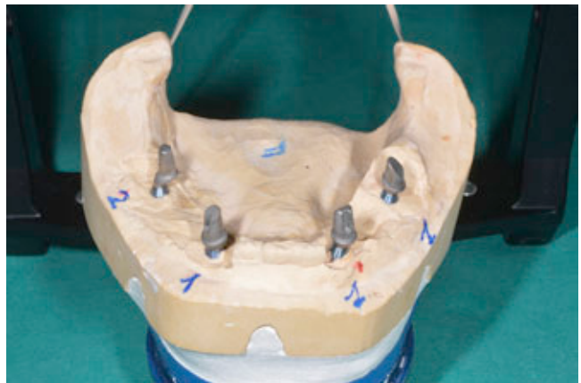
Fig. 2. Stone model with milled abutments. The parallel milling is necessary to achieve a passive fitting of prosthesis.

The fiber-resin bar is digitally designed (EXOCAD) on the computer, with a minimum thickness of 7.0 mm throughout, an abutment clearance of 30 microns for cement and a maximum